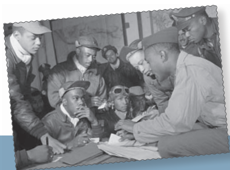
WWI and WWII Images from the Library of Congress online catalog