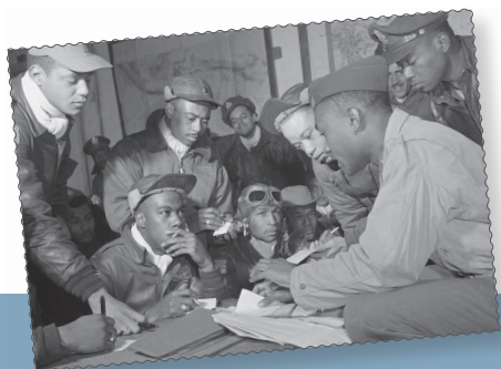
WWI and WWII Images from the Library of Congress online catalog

Audrey Morse has an extensive background as both a speech and language pathologist and an ESL teacher. She has taught all ages pre-K to adult, including teacher licensure courses.